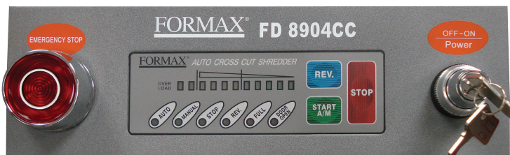
LED control panel with visual load indicator and safety key lock

The FD 8904B offers unmatched automated features through its LED control panel. The easy-to-read Load Indicator assists operators in determining how close they are to the maximum shred capacity to avoid jams and provide optimal efficiency. Operators can select from two modes of operation: Auto Start/Stop or Manual. Auto Start/Stop mode utilizes optical sensors which detect paper and start/stop operation automatically. Manual mode provides non-stop operation for shredding small sized paper or films. The Safety Key Lock prevents unauthorized use of the shredder.