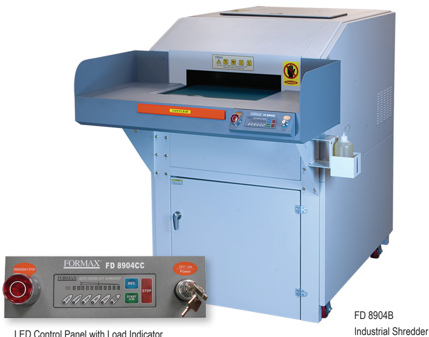
LED Control Panel with Load Indicator