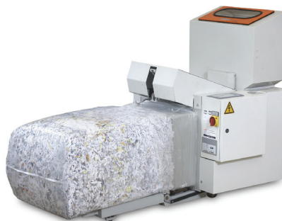
FD 8904B with full bale

The FD 8904B features a powerful high-capacity Output Baler which continually compacts shredded material into a bale, which improves throughput capacity by minimizing the frequency of unloading the shredder. Sensors automatically stop the shredding mechanism when the baler is full. The FD 8904B is the ultimate solution for high-capacity centralized shredding.