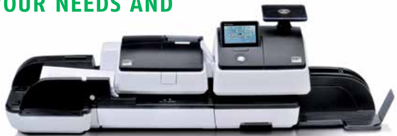
POSTBASE 85 WITH AUTO-FEEDER & SEALER